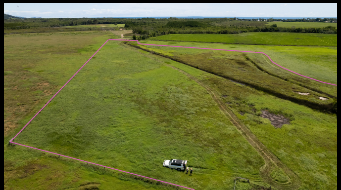
Aerial shots showing stages one and two (of five) of the planting area.

Shown below are just three of the species we expect to move into the new forest and wetland area, and three of the eighty species of tree we will be planting.