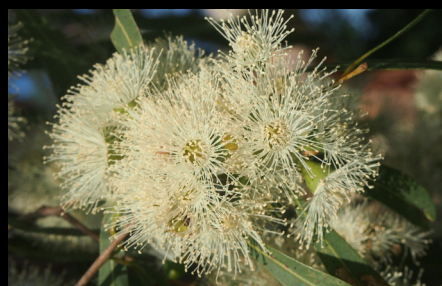
Moreton bay ash