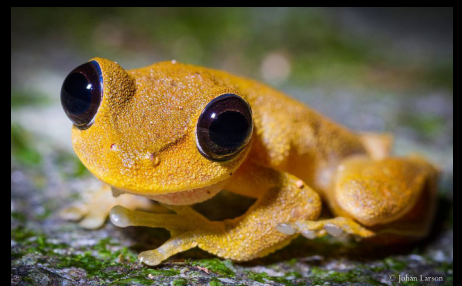
Australian lacelid frog