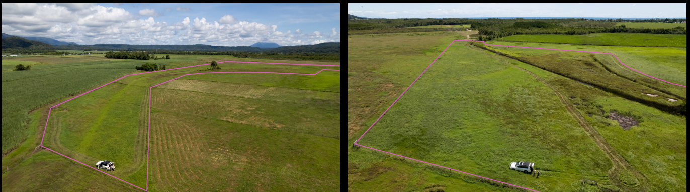
Aerial shots showing stages one and two (of five) of the planting area.

Our latest exciting project (starting July 2023) is to plant out stage one of 33,000 trees on five hectares of old grazing land to fully restore three endangered ecosystems back to original paperbark swamp with a vine rainforest understory. This will create an area of extensive and increased habitat, and significantly increase local food resource for a multitude of species - including 12 vulnerable and endangered listed species recorded in the area.